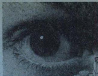
Close-up of Eye Taken with New Exakta "VX" Camera

New Model With Pre-Set Diaphragm Control