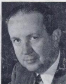
Leonard A. Scheele 1947-1948