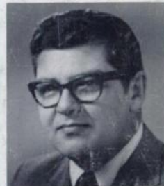
Frank J. Rauscher, Jr. 1972-1976