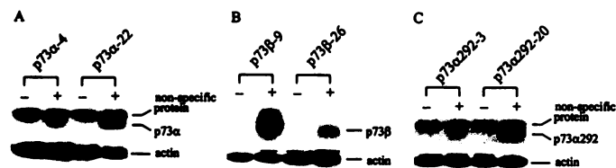
Fig. 1. Characterization of cell lines that inducibly express p73. A, levels of p73 \alpha (top) and actin (bottom) in p73 \alpha -4 and p73 \alpha -22 cell lines were assayed by Western blot analysis. Cell extracts were prepared from uninduced cells (–) and cells induced to express (+) p73 \alpha . The upper portion of the blot was probed with anti-hemagglutinin antibody 12CA5, and the bottom portion of the blot was probed with anti-actin polyclonal antibody. B, levels of p73 \beta and actin in p73 \beta -9 and p73 \beta -26 cell lines. The experiments were performed similar to that in A. C, levels of p73 \alpha 292 and actin in p73 \alpha 292-3 and p73 \alpha 292-20 cell lines. The experiments were performed similar to that in A.

Next, we determined whether p73 can regulate MDM2 , GADD45 , BAX , BTG2 , 14-3-3 \sigma , p85 , and KILLER/DR5 . We found that MDM2 , an oncogene and a negative regulator of p53 (14), was significantly induced by p73 \beta , albeit much less than by p53 (Fig. 3B). However, MDM2 was induced little, if any, by p73 \alpha . GADD45 , a DNA damage responsive gene involved in DNA repair (15), was slightly activated by p73 (Fig. 3C). BAX , an apoptosis activator that can be activated by p53 (8), was induced little, if any, by p73 (Fig. 3D). BTG2 , a nerve growth factor responsive gene that can cause growth suppression (6), was weakly activated by p73 (Fig. 3E). Surprisingly, 14-3-3 \sigma , a gene that might mediate p53-dependent G 2 -M arrest, was induced by p73 \alpha and p73 \beta to an extent that is six and two times greater than by p53, respectively (Fig. 3F). p85 is a regulatory subunit of the signaling protein phosphatidylinositol-3-OH kinase that might be involved in the p53-dependent apoptotic response to oxidative stress (11). On H 2 O 2 treatment, the level of p85 was increased in a p53-dependent manner (11). We found that p85 was induced 2–3-fold by either p53, p73 \alpha , or p73 \beta , but not p73 \alpha 292 (Fig. 3G; Table 1). KILLER/DR5 , a death receptor gene that can be induced by genotoxic stress and p53 (9), was weakly induced by p53 and p73 \beta but little, if any, by p73 \alpha (Fig. 3H; Table 1).